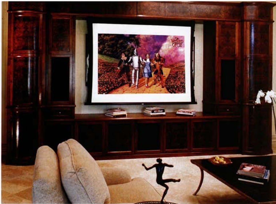
Francois Langin Designs