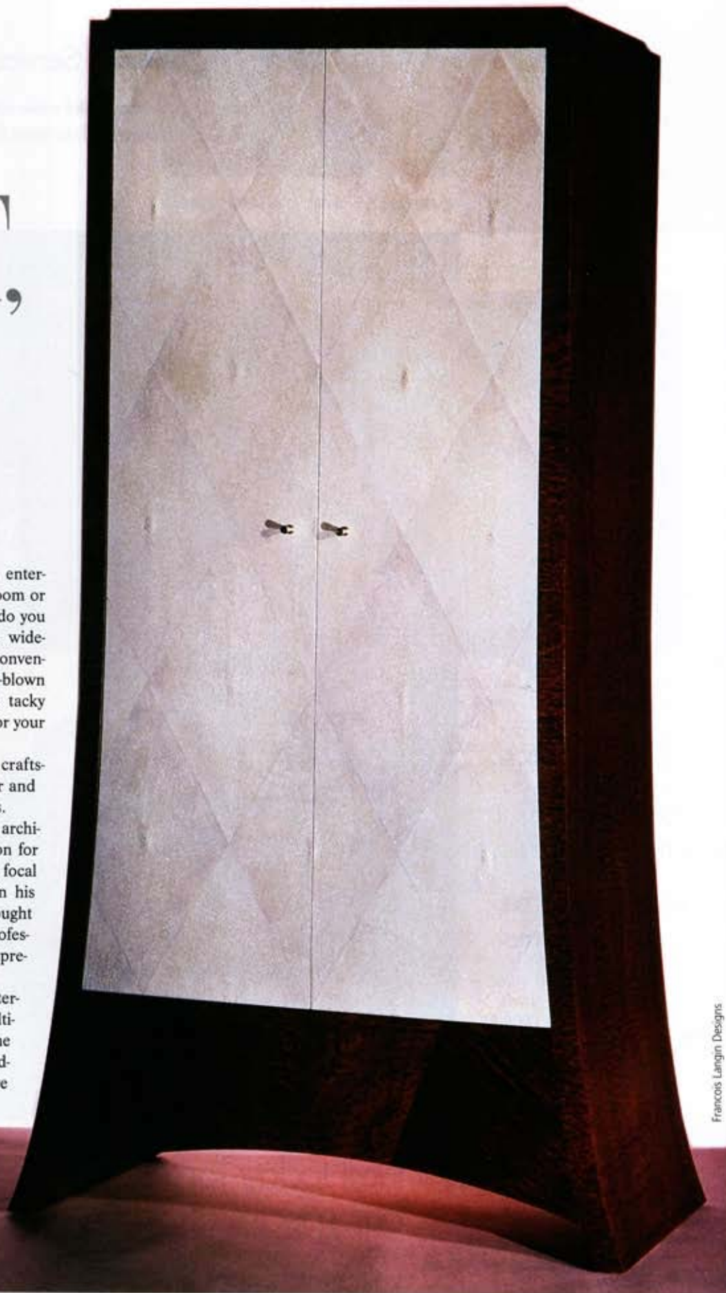
DESIGNED AS all-purpose armoire, this cabinet serves as a wine rack and cigar humididor.

Langin began designing home-entertainment units in 1992 to hide multi-speaker stereo systems. These days he builds built-in wall units and freestanding centers to house today's expansive